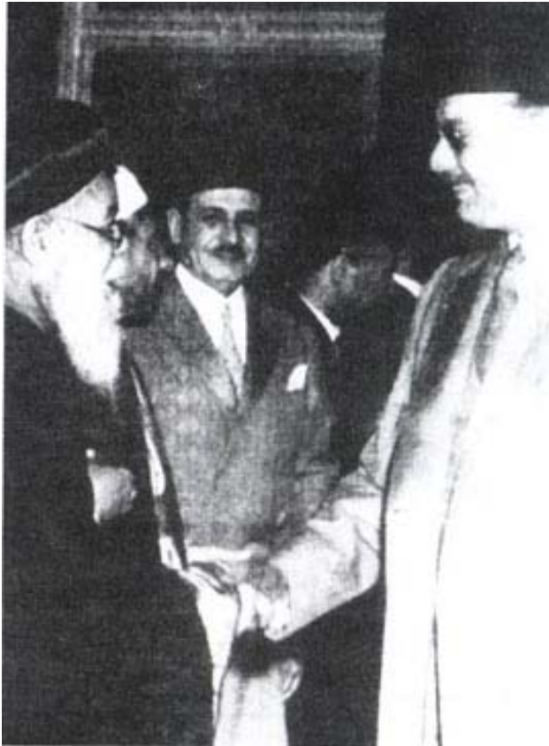
A 55 years old photo of His Majesty Farouk I receiving HH Pope Yousap II with a welcoming smile. Prime Minister at that time Ali Maher Pasha is seen standing at the middle.