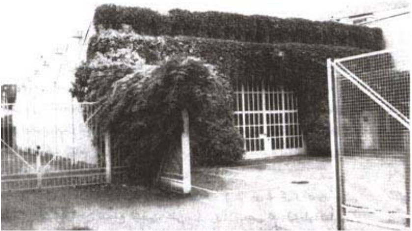
The Church of St. Joseph of Arimathea and the building's area is 648 m 2 and it has a yard with an area of 380 m 2