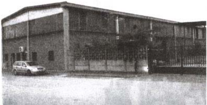
The Church of St. Helen and the building shown above has an area of 480 m 2 and its total area is 1360 m 2